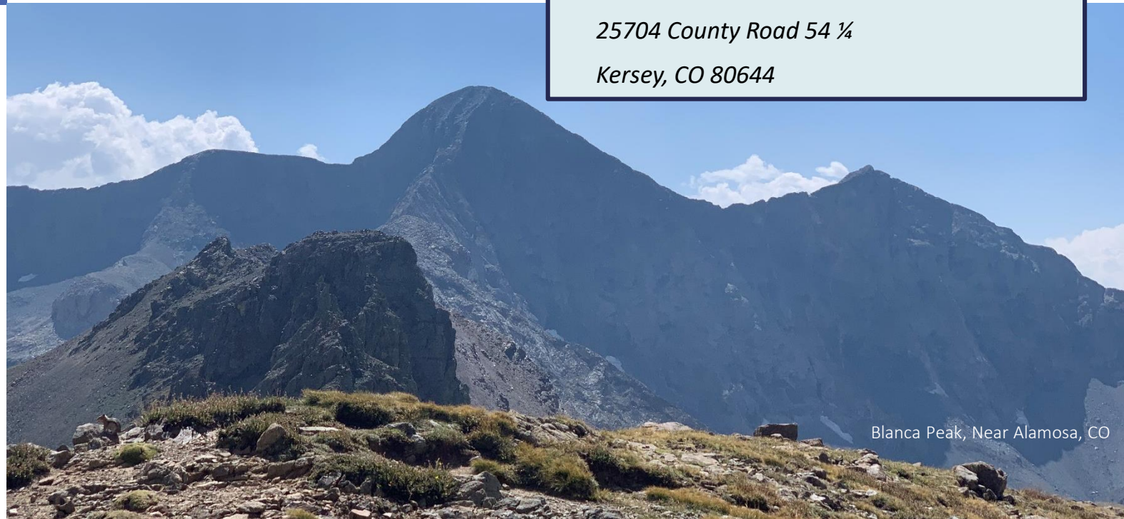
Blanca Peak, Near Alamosa, CO